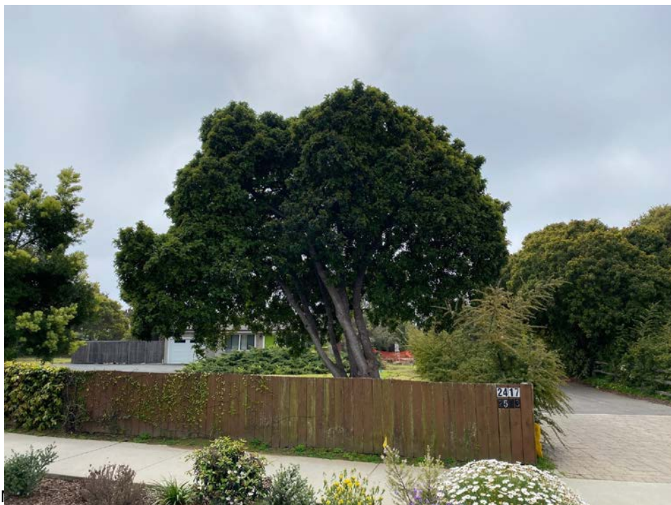
Front Yard 2501